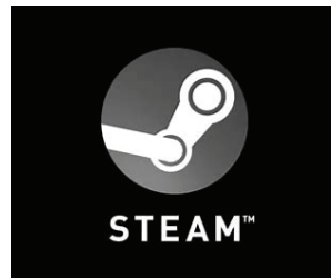
Steam Global Game Platform