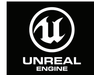
Unreal Engine Game Engine