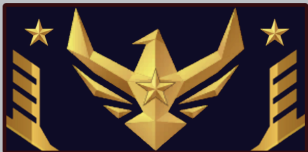
Supreme Eagle: Guardian